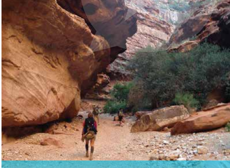
SD Goode exploring the Grand Canyon

- GARETT REPPENHAGEN, CAVALRY SCOUT/SNIPER. US ARMY 1ST INFANTRY DIVISION